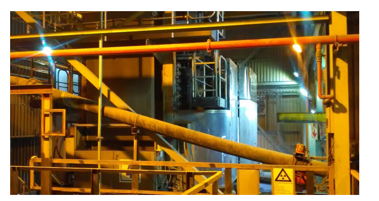
INCREASE IN THROUGHPUT