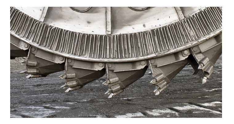
INCREASE IN ENERGY EFFICIENCY