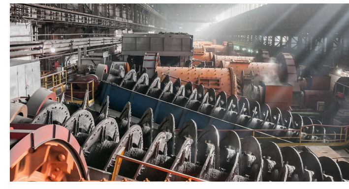
NCREASE IN THROUGHPUT